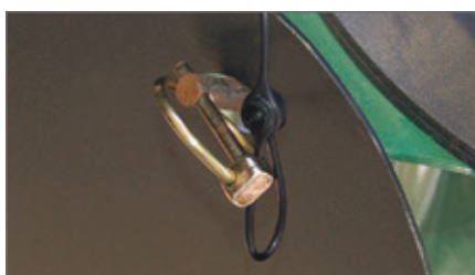
Intake Hose Storage Simple secure nozzle hook for convenient and efficient storage.