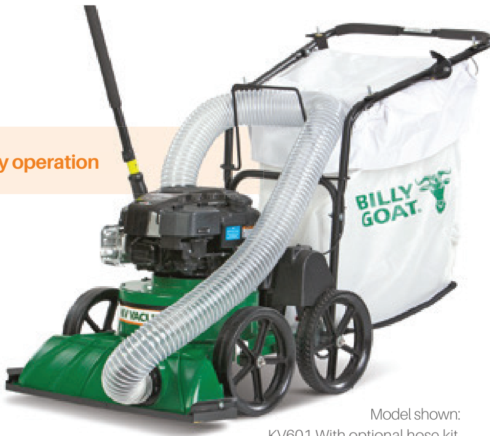
Model shown: KV601 With optional hose kit