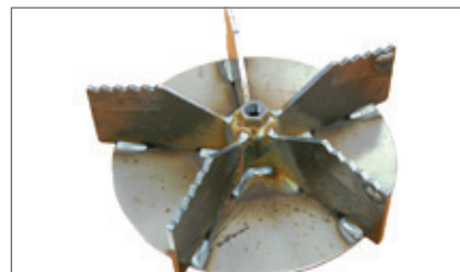
5-Blade Serrated Impeller Maximizes suction, long life time and debris reduction.