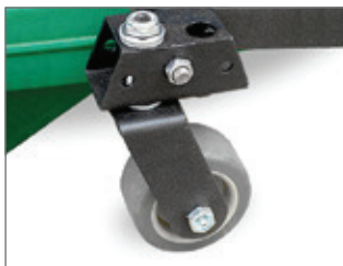
Caster Wheel Kit Increases manoeuvrability. (80023276)