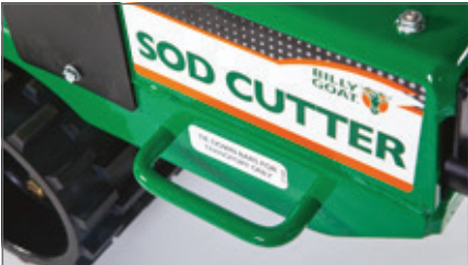
Tie Down Points Convenient tie-downs make machine transport safe.