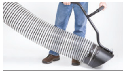
Urethane Clear Hose Clear hose allows for visual inspection and quick removal of hose clogs. Replacement hoses are available.