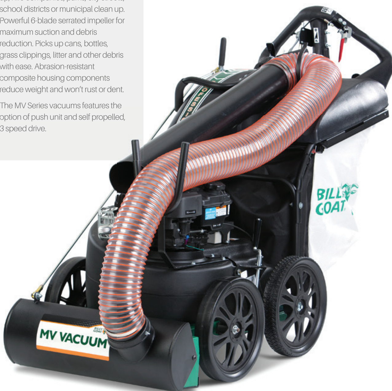
Model shown: MV601SPH with optional hose kit

The MV Series vacuums features the option of push unit and self propelled, 3 speed drive.