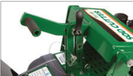
Set and Forget™ Blade Depth Adjustment Single lever and clamp at user's operating position adjusts simply, saving time and providing precise cutting depths to 6 cm.