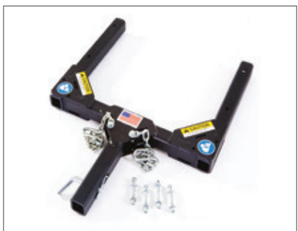
CustomFit™ Receiver Hitch Simple to install and remove and easily mounts to your truck for use with DL14 and 18 loaders.