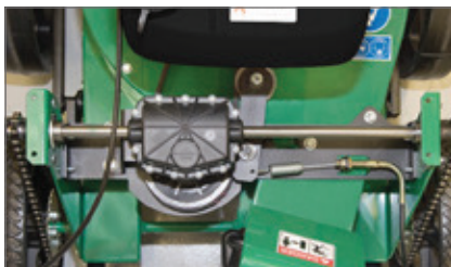
Robust Transmission Single speed self propelled. Great for hilly turf applications. KV601SPH