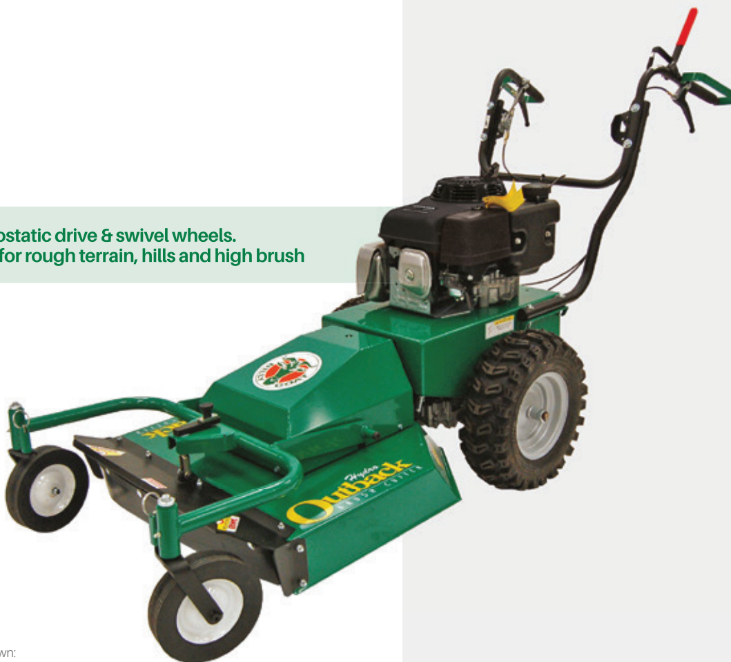
Product shown: BC2601HHC

Hydrostatic drive & swivel wheels. Ideal for rough terrain, hills and high brush