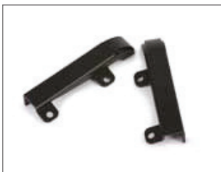
Nozzle Wear Kit Prevents nozzle wear on hard surface applications. (80023275)