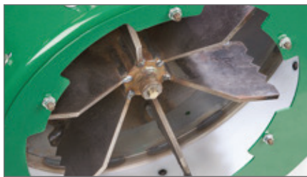
Dual Shredding System with Piranha™ Blade For extra shredding. Serrated blades with cutting points for maximum loading. Debris reduction up to 12:1.