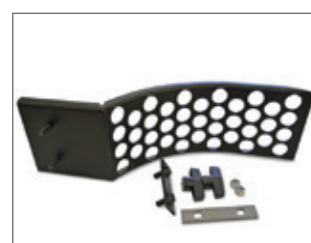
Shredder Screen Kit Reduces dry leaves up to 12:1. (80023256)