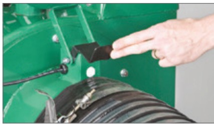
Safety Kill Switch Quick connect / release hose clamp with safety interlock.