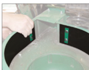
Liner Sleeve Protects housing in sandy conditions. (80023278)