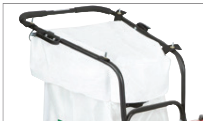
Integral Dust Skirt Keeps dust down and away from the operator.