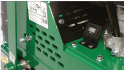
Vented Housing and Service Doors Provides increased venting for cool operation. Three easy access service doors located at front / back of machine offer convenient access for servicing.