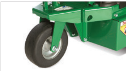
Rear Swivel Caster Perfect for curved work or making turns at the end of a pass. Locks for straight cutting.