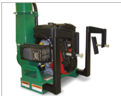
CustomFit™ Hanger Kit Easy to install, locks in place with 2 bolts. Suits DL14 and DL18 loaders.