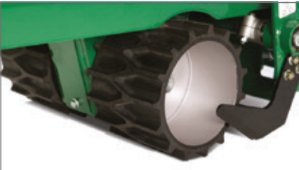
Unique Paddle-Style Drive Wheels SC181H model. For landscape applications. Designed to shed mud in wet conditions and grip in dry for improved cutting in all conditions.