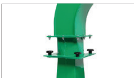
Adjustable Rotating Discharge Chute No tool, hand adjustable rotating discharge chute allows 360° positioning.