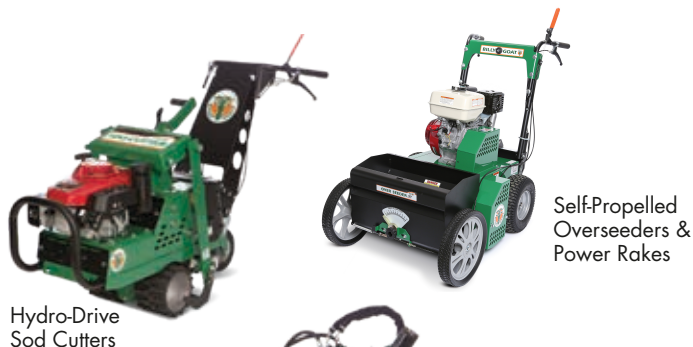
Self-Propelled Overseeders & Power Rakes