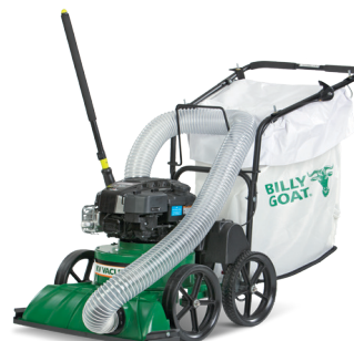
Lawn & Litter Vacuums