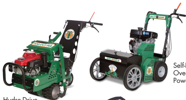
Hydro-Drive Sod Cutters