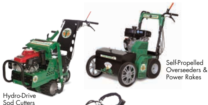
Self-Propelled Overseeders & Power Rakes