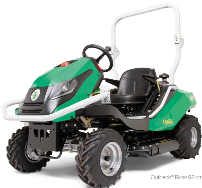
Outback® Rider 92 cm