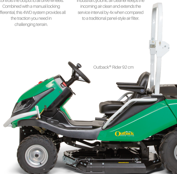
Outback® Rider 92 cm

A remote transmission oil cooler controls the transmission oil temperature even in the toughest conditions, reducing thermal oil breakdown and extending the operating life of the system.