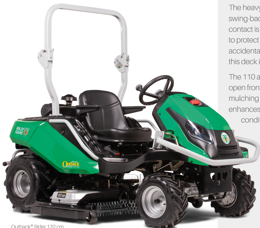
Outback® Rider 132 cm